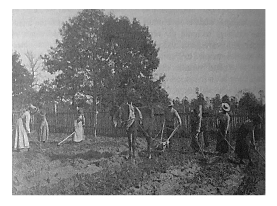
Female prospective teachers plough school fields at the Hampton Institute. Anderson, <u>The</u> <u>Education of Blacks in the</u> <u>South</u>, 48.

that black teachers would spread industrial education and its accompanying moral transformation. Thus, while white prospective teachers in the South received four-year liberal arts educations at state normal schools designed to provide what instructors called "genuine literary culture," black prospective teachers at Hampton and Tuskegee spent more hours performing unskilled manual labor than they did in class.<sup>15</sup> The academic classes they did take taught them that African-American poverty was due to less advanced "racial evolution" and stressed harmonious relations between labor and capital.<sup>16</sup> Industrial education, then, was the pedagogy of Jim Crow, designed to acculturate children into a system of political, economic, and social segregation.